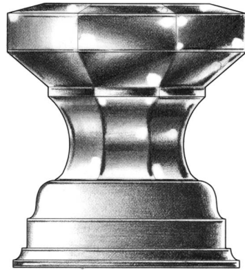
SIZE L 2½ inch Diagonal