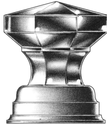
SIZE L 2½ inch Diagonal