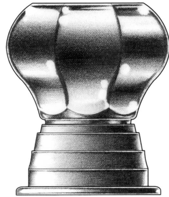
SIZE L 2 \frac{3}{8} inch Diagonal