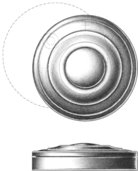
Cylinder Ring with Swinging Cover