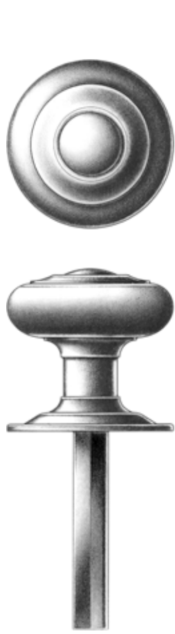
Thumbturn and Rose