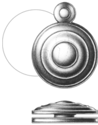
Emergency Trim Ring with Swinging Cover