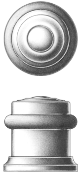
Cylindrical Floor Stop with Trim Ring