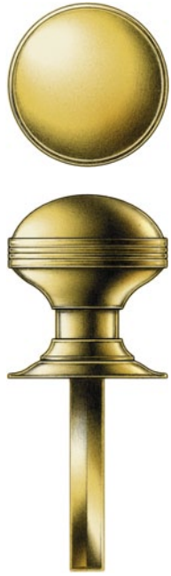
Thumbturn and Rose