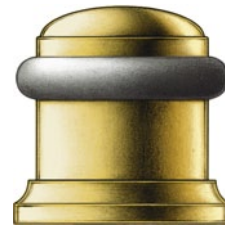
Cylindrical Floor Stop with Trim Ring