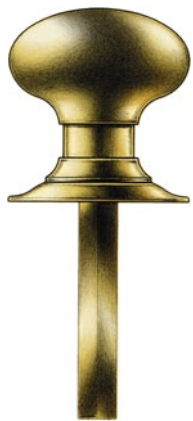
Thumbturn and Rose