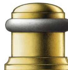
Cylindrical Floor Stop with Trim Ring