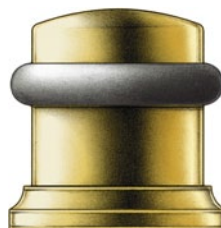
Cylindrical Floor Stop with Trim Ring