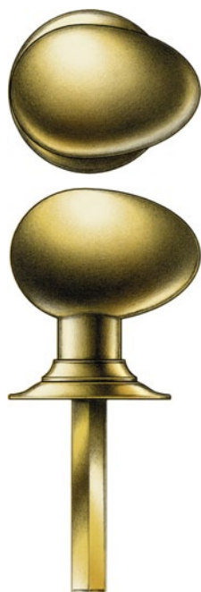
Thumbturn and Rose