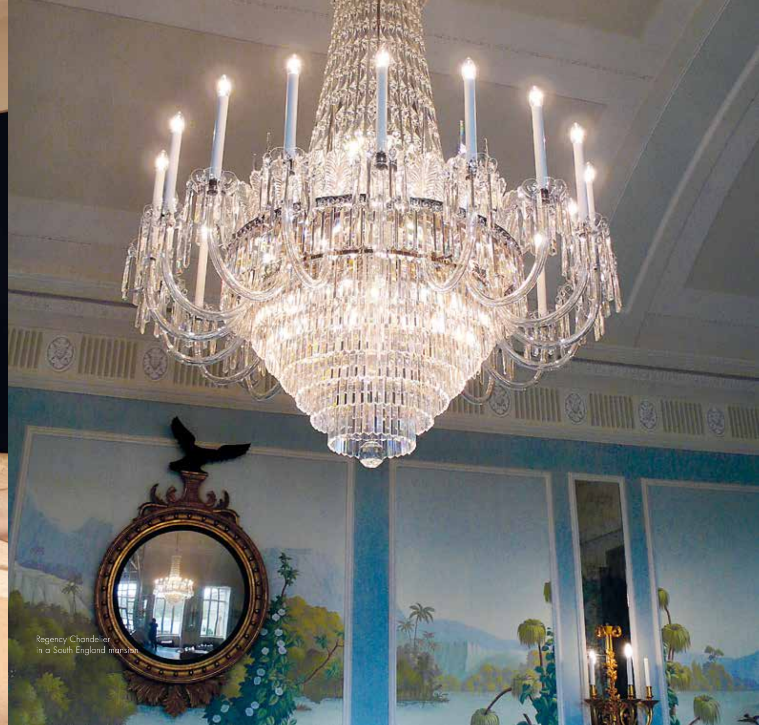
Regency Chandelier in a South England mansion