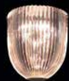
Art Deco Wall sconce 42358-W-1 Lobjmeyr, 2005

W.: 15 cm, H.: 16 cm P.: 8 cm; Wt.: 2 kg 1 light; max. W.: 60 Brass, hand cut crystal; Nickel finish