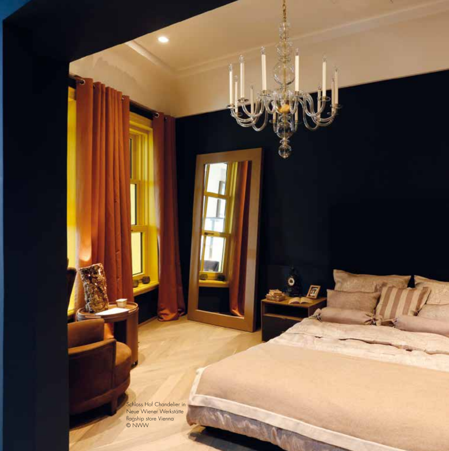
Schloss Hof Chandelier in Neue Wiener Werkstätte flagship store Vienna