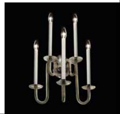
Schloss Hof Wall sconce 4636-W-2 Historical, ca. 1720

Dia.: 80 cm, H.: 73 cm Wt.: 10 kg 8 lights; max. W.: 480 Brass, lead-free crystal; Nickel finish