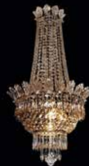
Regency Pendant 42687-9 Historical, ca. 1815

Dia.: 46 cm, H.: 108 cm Wt.: 8 kg 9 lights; max. W.: 540 Brass, hand-cut crystal; Nickel finish