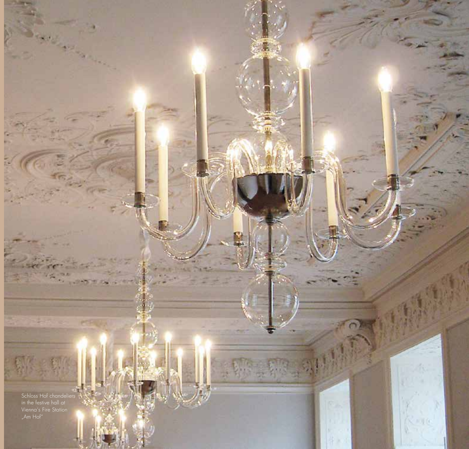
Schloss Hof chandeliers in the festive hall at Vienna's Fire Station „Am Hof“