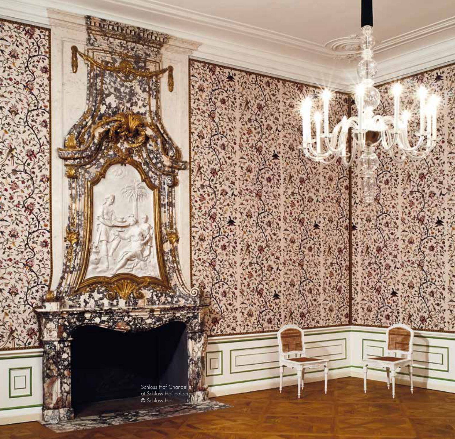
Schloss Hof Chandelier at Schloss Hof palace