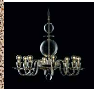
Musseline Chandelier 42426-8 Hans Harald Rath, 1925

W.: 50 cm, H.: 70 cm P.: 29 cm; Wt.: 9 kg 5 lights; max. W.: 300 Brass, lead-free crystal; Nickel finish