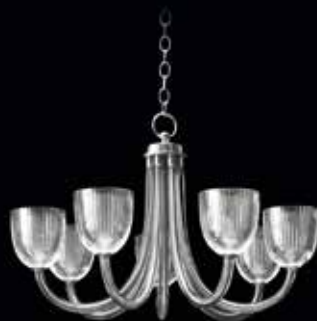
Prutscher Chandelier 4257-7 Otto Prutscher, 1934

W.: 15 cm, H.: 16 cm P.: 8 cm; Wt.: 2 kg 1 light; max. W.: 60 Brass, hand cut crystal; Nickel finish