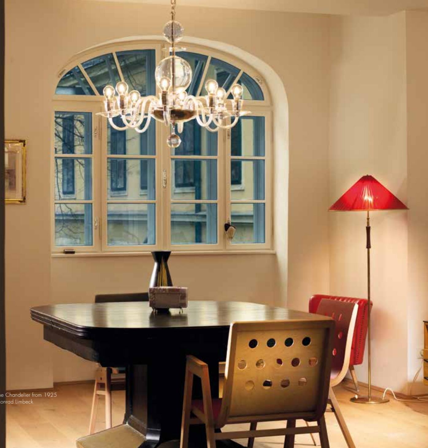
Mousseline Chandelier from 1925