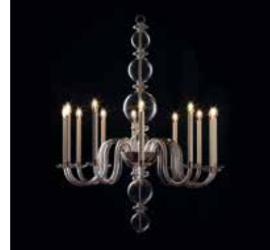
Schloss Hof Chandelier 4636-12 Historical, ca. 1720

As such this style is an embodiment of Lobmeyr's philosophy.